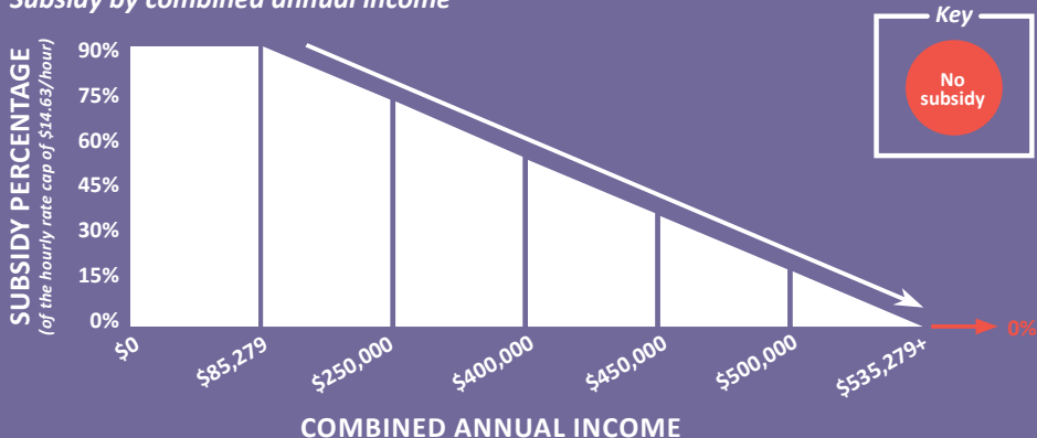
Subsidy by combined annual income

*Based on eldest or only child. Families with more than one child in care may be eligible for a higher subsidy for their second child and younger children.